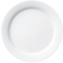
9" NARROW RIM DINNER PLATE