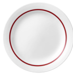
6.25" NARROW RIM BREAD & BUTTER PLATE